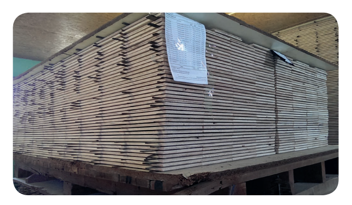
Figure 1: A pallet of wood before fuming with ammonia.