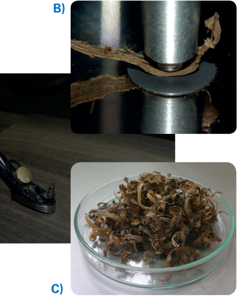
Figure 3: Workflow of the "Scheucher-Scan". A) Removal of a single chip of fumed oak B) Fumed Oak chip pressed onto the diamond ATR C) Used chips after analysis (waste).