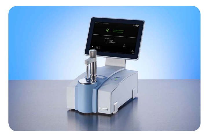
Figure 2: ALPHA II FTIR spectrometer equipped with the platinum diamond ATR and high pressure applicator.

Analysis is further simplified by the beforementioned easy to operate Platinum diamond ATR-module incorporating a hard-wearing and chemically inert diamond that can withstand even the most corrosive substances. With its ergonomic and failsafe one-finger clamp mechanism and 360° hinged pressure applicator, sampling is effortless even for staff without special training.