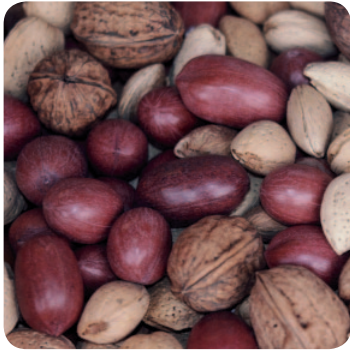
Oil and Moisture Determination by minispec on various Types of Samples