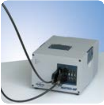
Automated 6-port multiplexer with Bruker's proprietary quick connector (BQC)