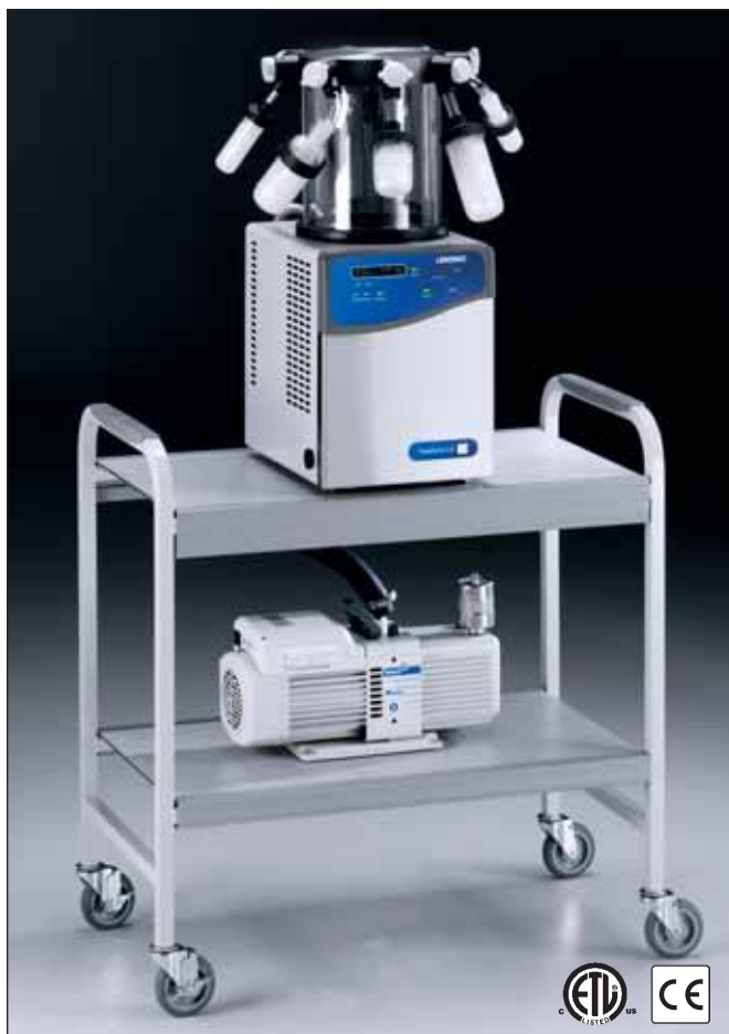
FreeZone 2.5 Liter Benchtop Freeze Dry System 7670520, Clear Chamber with Valves 7443500, General Purpose Vacuum Pump 7438700, Portable Table 8025000 and miscellaneous glassware.