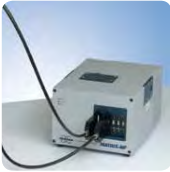
Automated 6-port multiplexer with Bruker's proprietary quick connector (BQC)